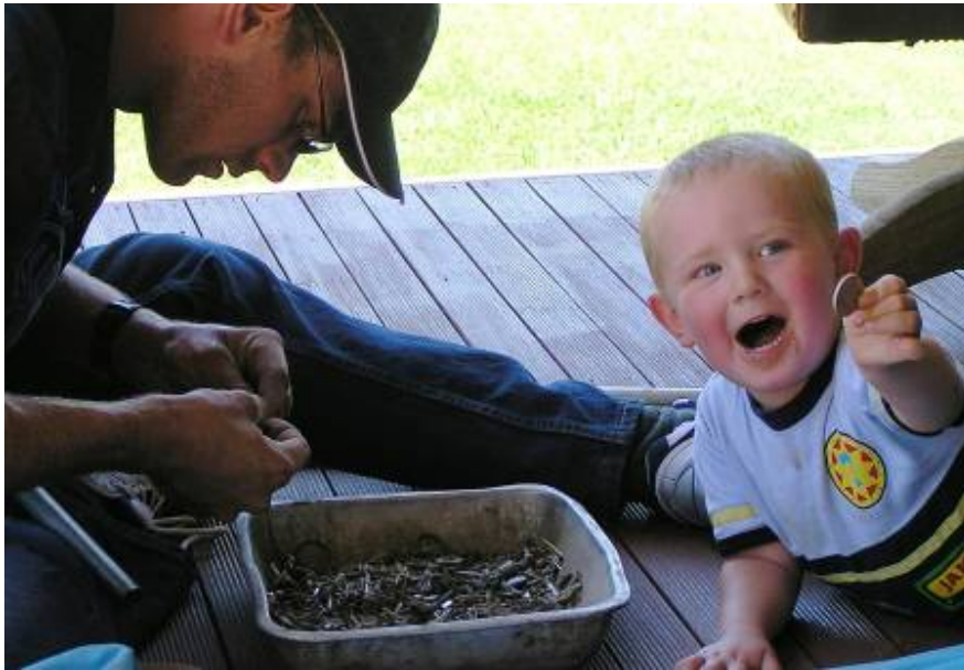
Just one of our favourite photos from 2009